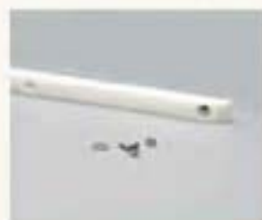
Optional Polyethylene Runners

Trail Boggan's tie-down points make securing a load easy.